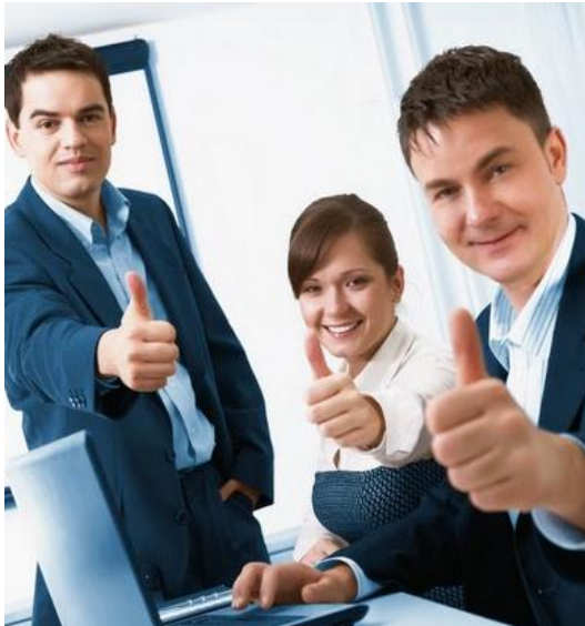
Client & Consultant Collaboration

We help create valued experiences for your customers & employees, and enable your organization to prosper.