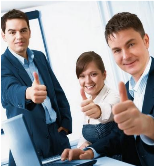
Client & Consultant Collaboration

We help create valued experiences for your customers & employees, and enable your organization to prosper.